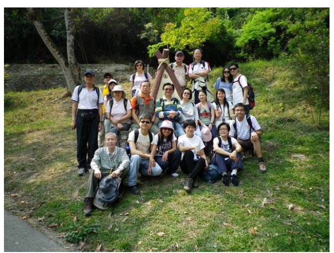
Partial representation of the large ITP hiking group (others busy taking photos or dashing for the washrooms)

The Spring hiking on April 3 was certainly the most successful outing organized by ITP since its founding in terms of the number of participants. Close to thirty assembled outside a convenience store at the Eastern Railway Fan Ling Station at around 9:30 am. The group was so big that it took two green mini-buses to get everyone to the actual starting point of the hiking — outside the Hok Tau (鶴藪) Lavender Garden.