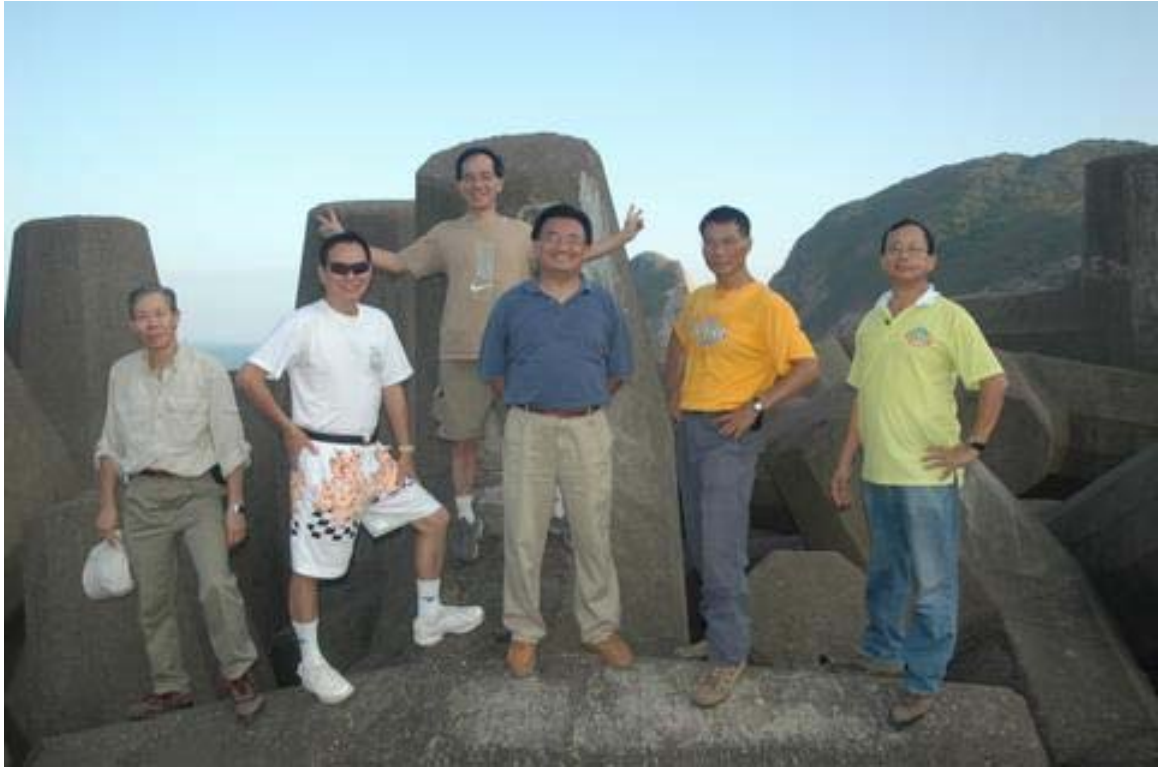
A magnificent shot showing some of the tour members – High Island Hiking, November 2004