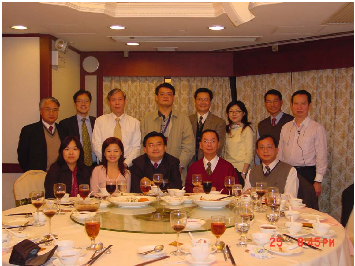
ITP Spring Dinner – February 2005: Guests, Members and ExcOs