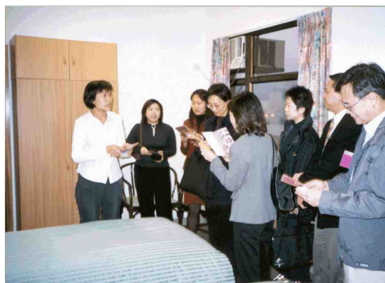
Hall manageress discussed with members in a standard resident room

visiting scholars. The Hall consists of 20 single and 10 twin residential rooms accommodating up to a maximum of 40 persons. 2 function rooms inside the hall are available for small group workshops and seminars. A recreation room is also available for relaxation after a day's workout. Other facilities like canteen, lecture theatre and library can be accessed via the Tsing Yi Main Campus. The ideal group size, as recommended by Miss Ma, should be between 16 to 20. Rental of the facilities could be made on a daily or package basis.