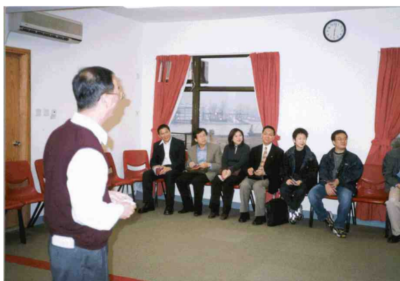
Vice-chairman welcomed members to the FYT Hall

From time to time, ITP would organize visits and seminars for its members and associates. A visit to the Fok Ying Tung Hall of Residence at the VTC Tsing Yi Campus on 16 January 2002 was organized for members and associates.