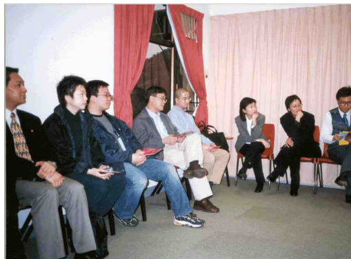
Members discussing experiential training