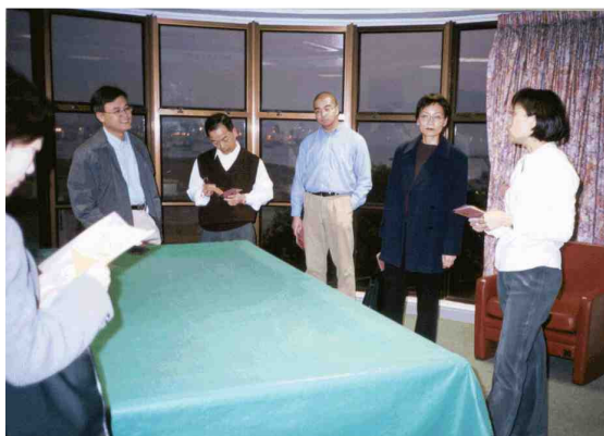
Hall manageress showed members the hall facilities