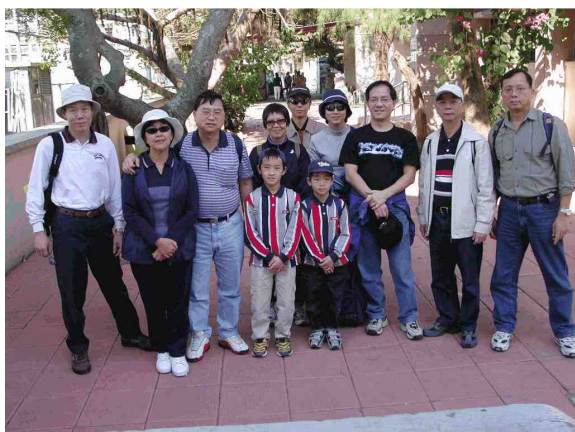
Members and “associates” at Yung She Wan

Memorable shots included a bird-eye view of the Lamma Island power station, a distant view of the Hong Kong Island; the relaxing Hung Sing Yeh Bay, and the Kamikashi torpedo boat caves. The enjoyable trip rounded off with a grand seafood dinner serving big steamed fresh shrimps and a 3-catty garoupa (that group members nick-named them as “broiled Kandahar” and “steamed Taliban” respectively). With a stomach-full of splendid sea food and tons of good memories the group members dispersed and bid each other farewell at the ferry pier in Central around 9:30 p.m.