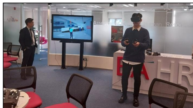
Observing the Training by use of VR

With the help of a HRM student, Mr. Lam demonstrated how VR could equip the trainee, who might be a security guard or a customer service representative, to respond and to react appropriately in a scenario of handling crisis in a shopping mall and the carpark. Usually, only the person who is wearing the VR device can see the images. When the images are projected to a TV or a big screen, other trainees can observe and participate together. The advantages are to efficiently provide basic training to the participants at one time regardless of physical limitations and safety problems. Trainees can learn from mistakes and stay alert to avoid them in reality.