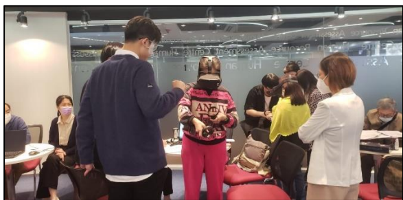
Participating in VR Game

Afterwards, with the help of students who are studying HRM, we participated in a VR game to dismantle the bombs. This was my first time experiencing the fun of using VR. It seems like watching an interactive movie personally.